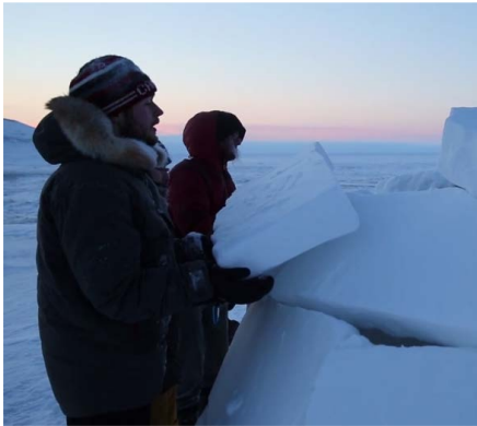
Ulukhaktok - A short film

All briefs produced & filmed by R. Schindler