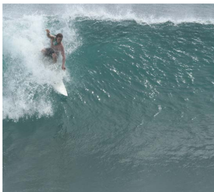
Client: johncantor.com.au (mini doc)