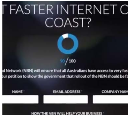
Client: DSC (Action Plan)