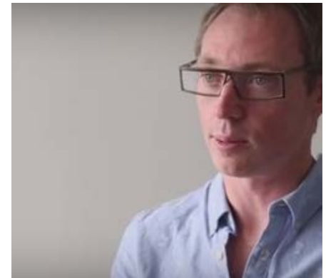
Client: DSC (Ted x Noosa)