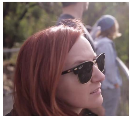
The Grampians - segment