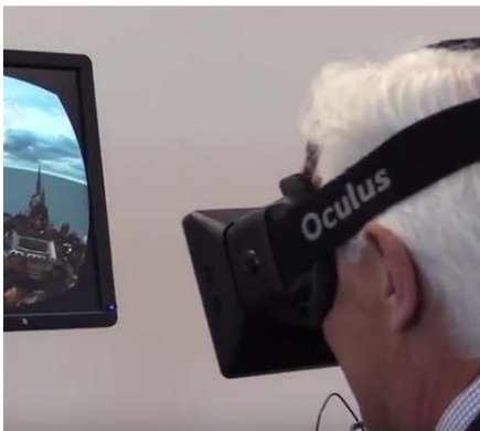
Client: Digital Sunshine Coast